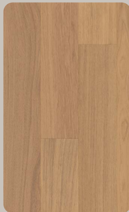
ESSENZA Esthetic Oak 166.5 × 612-1230 × 6.3 mm