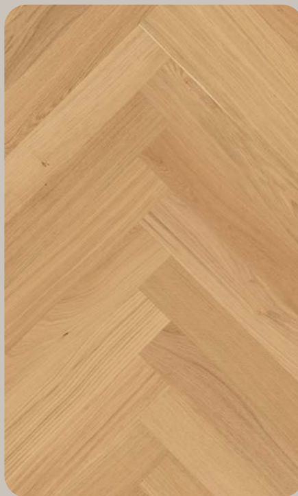
FUTURIS Esthetic Oak Herringbone 126.4 × 632 × 6.3 mm