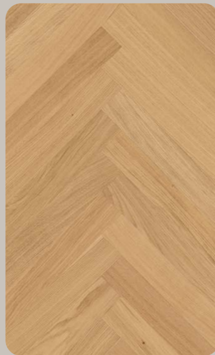
FUTURIS Esthetic Oak Herringbone 91.3 × 547.8 × 6.3 mm