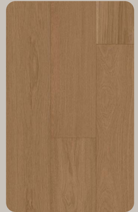
VERANO Esthetic Oak 196.5 × 612-1230 × 6.3 mm