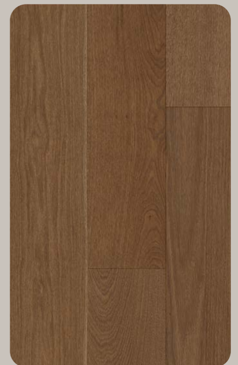
REVONA Origin Oak 196.5 × 612-1230 × 6.3 mm