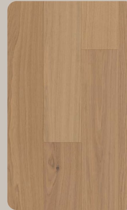
HARMON Esthetic Oak 166.5 × 612-1230 × 6.3 mm