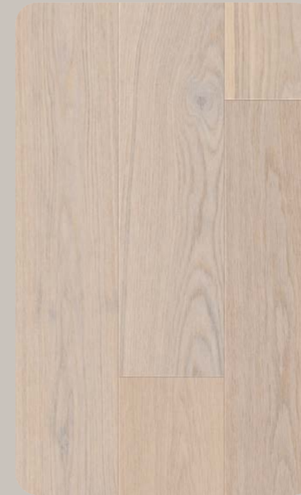
AURANTIS Esthetic Oak 196.5 × 770-1546 × 6.3 mm