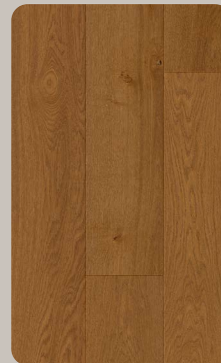
VITARIA Origin Oak 196.5 × 770-1546 × 6.3 mm