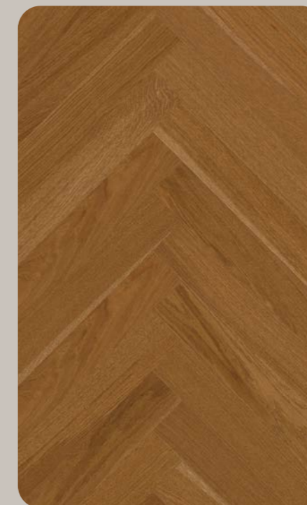
VITARIA Origin Oak Herringbone 91.3 × 547.8 × 6.3 mm