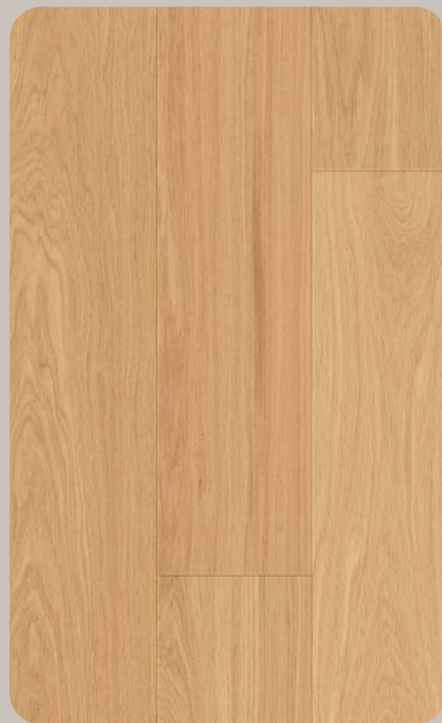
FUTURIS Esthetic Oak 196.5 × 770-1546 × 6.3 mm