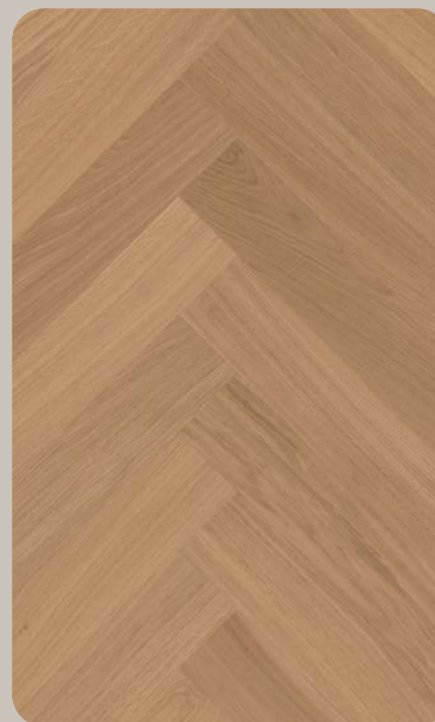
ESSENZA Esthetic Oak Herringbone 126.4 × 632 × 6.3 mm