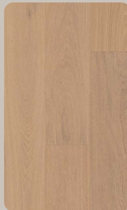
EVANA Esthetic Oak 196.5 × 612-1230 × 6.3 mm